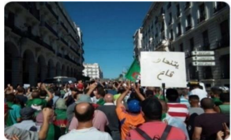
Collectif NABNI, Octobre 2019.

Wid i y-iħekkemen ad ttwakksen yiwet yiwet, deg tallit n leedil, s tsudiwin yebnan yef unagraw asertan agdudan, wid ara d-yerren wiyid ur xedmen ara kan array-nsen, ula d nutni ad seun aħkim, yecban wid yef i d-tettmeslay tyeryert Yatnahaw gaξ